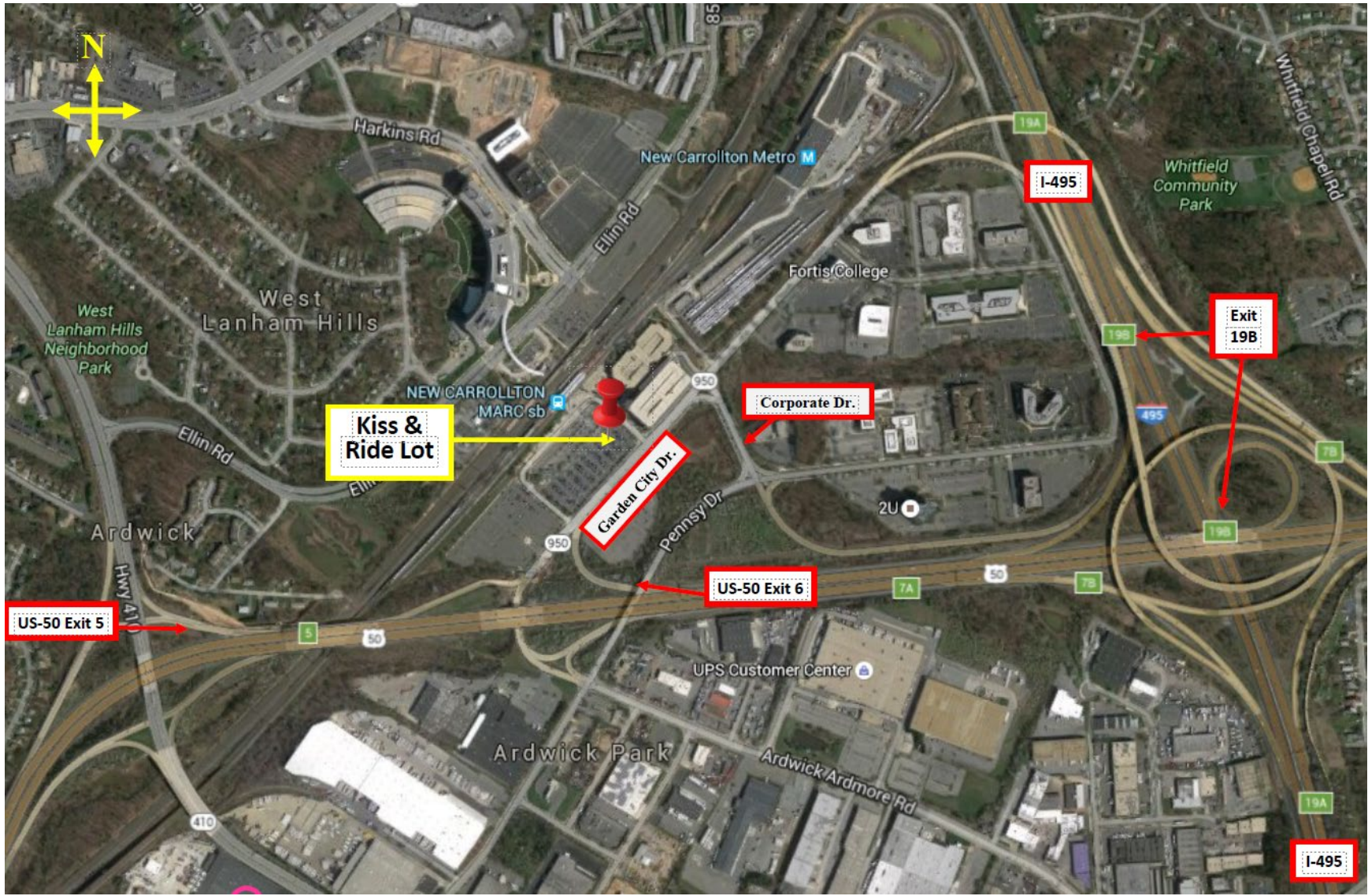
Wide map of New Carrollton Metro East-Side Kiss & Ride

Interstate-495/95, Exit 19B & US-50/John Hanson Highway