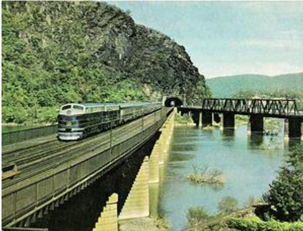
B&O's Columbian crossing the Potomac River at Harpers Ferry, West Virginia, 1949

The Baltimore and Ohio Railroad (reporting marks B&O , BO ) is one of the oldest railroads in the United States and the first common carrier railroad. It came into being mostly because the city of Baltimore wanted to compete with the newly constructed Erie Canal (which served New York City) and another canal being proposed by Pennsylvania, which would have connected Philadelphia and Pittsburgh. At first this railroad was located entirely in the state of Maryland with an original line from the port of Baltimore west to Sandy Hook. At this point to continue westward, it had to cross into Virginia (now West Virginia) over the Potomac River, adjacent to the