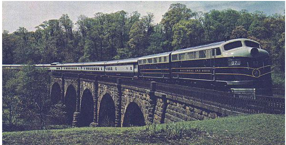
The Columbian on Thomas Viaduct, Relay, Maryland, in 1949

In railroading's golden age the B&O was one of several trunk lines uniting the northeast quadrant of the United States into an industrial zone. It was the southern border as the New York Central was the northern border. The Pennsylvania Railroad controlled the center, and smaller roads like the Lackawanna, Lehigh Valley, and the Erie survived largely through the Interstate Commerce Commission. The corners of this map are Baltimore in the southeast, Boston in the northeast, Chicago in the northwest, and St. Louis in the southwest.