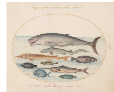
Sperm Whale, Sturgeon, Shark, and Other Fish (plate 2)