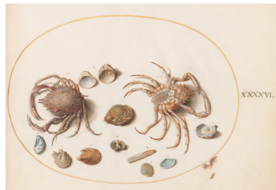
Two Crabs with Seashells (plate 46)