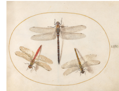
Hairy Dragonfly and Two Darters (plate 54)

Rotation 3: August 11–September 21, 2025