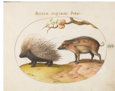
Old World Porcupine (Hystrix) and Wild Pig (plate 17)