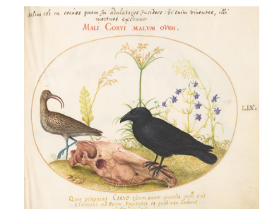
Curlew and Crow with Horse Skull (plate 59)