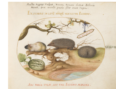
Guinea Pig and Hedgehogs with Melon and Cobnuts (plate 48)