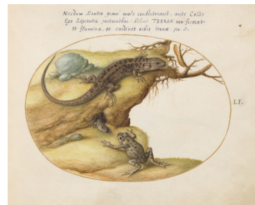
Two Sand Lizards, a Common Parsley Frog (?), and a Caterpillar (plate 51)