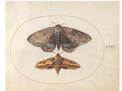
Blue Underwing Moth and Spurge Hawk Moth (plate 25)

Rotation 4: September 22–November 2, 2025