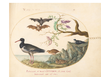
Bats, Quail, and Oystercatcher (?) by the Water (plate 46)