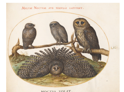
A Tawny Owl, an Eagle Owl, and Two other Owls (plate 55)