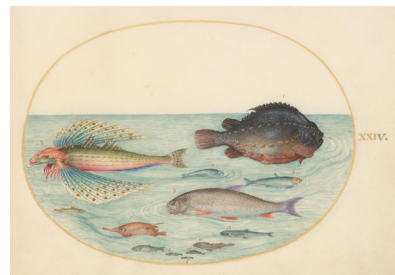
Flying Swallow Gurnard, Male Lumpsucker, Longspine Snipefish, and Other Fish (plate 24)