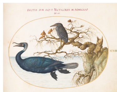
A Brandt's Cormorant with a Juvenile Crowned Night Heron (plate 23)