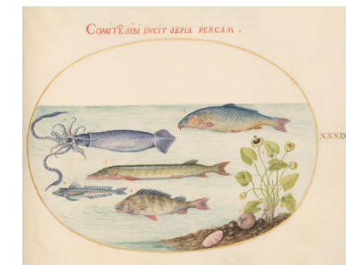
Squid, Gurnard, Pike, and Other Fish (plate 39)