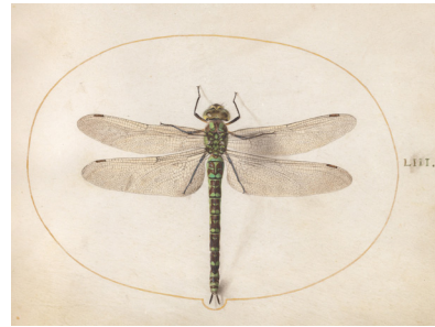
Southern Hawker Dragonfly (plate 53)