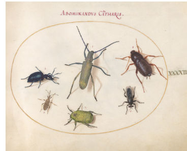
Musk Beetle, Oil Beetle, Tansy Beetle(?), Cockroach, Leaf-Footed Bug, and Other Insects (plate 43)

Rotation 3: August 11–September 21, 2025