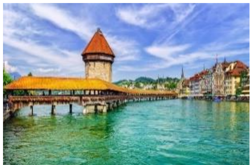
Lake Lucerne bridge

https://www.smithsonianjourneys.org/tours/treasures-alps/itinerary/