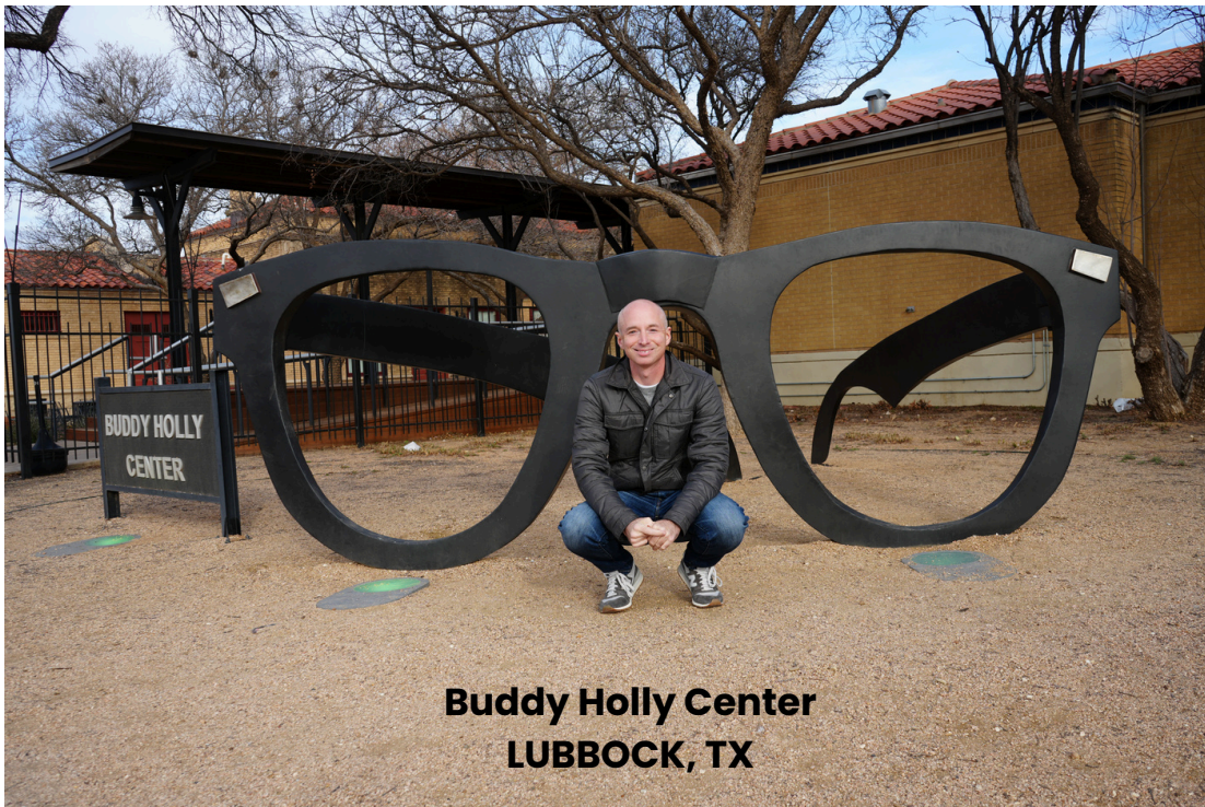
Buddy Holly Center LUBBOCK, TX