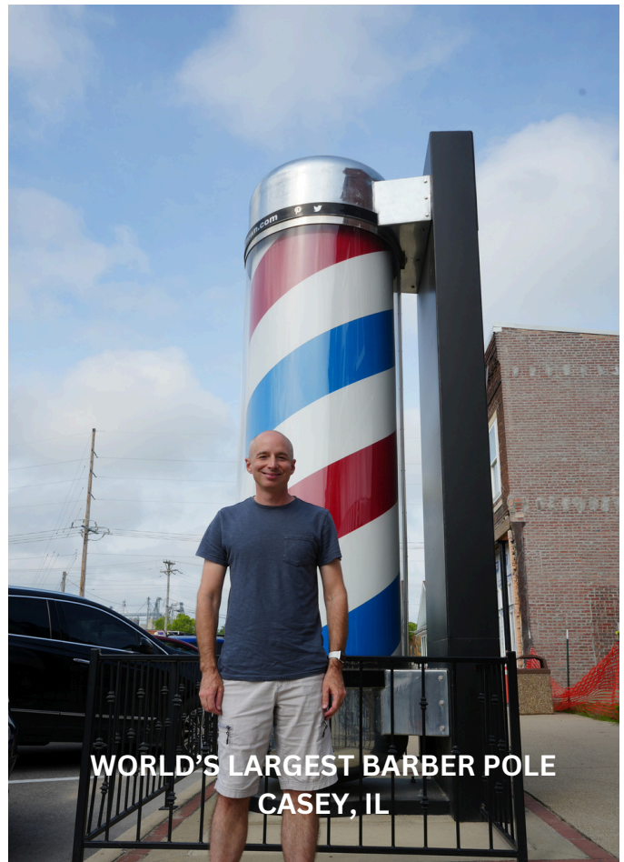
WORLD'S LARGEST BARBER POLE CASEY, IL