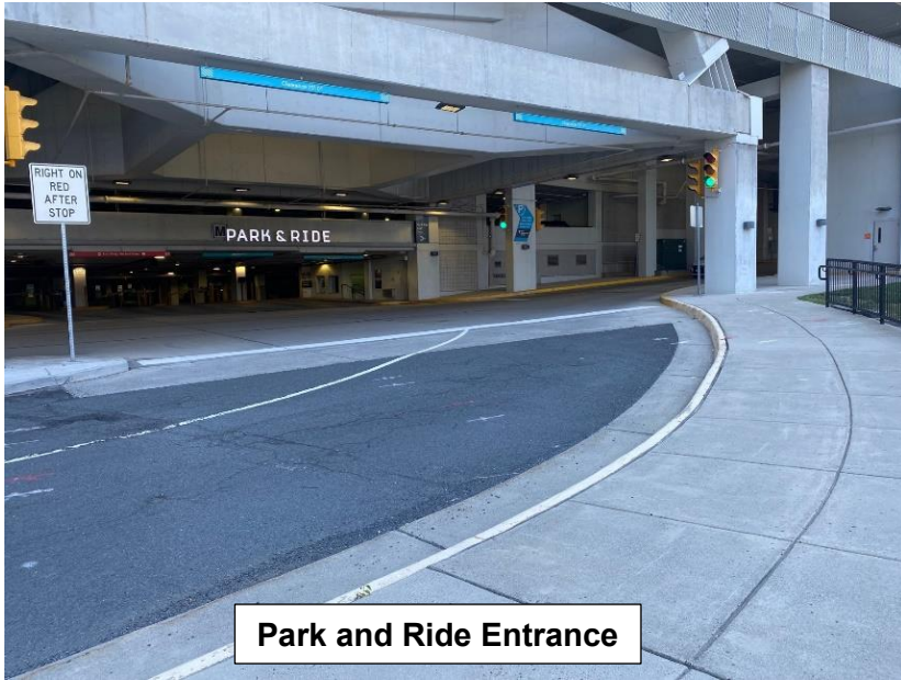
Park and Ride Entrance